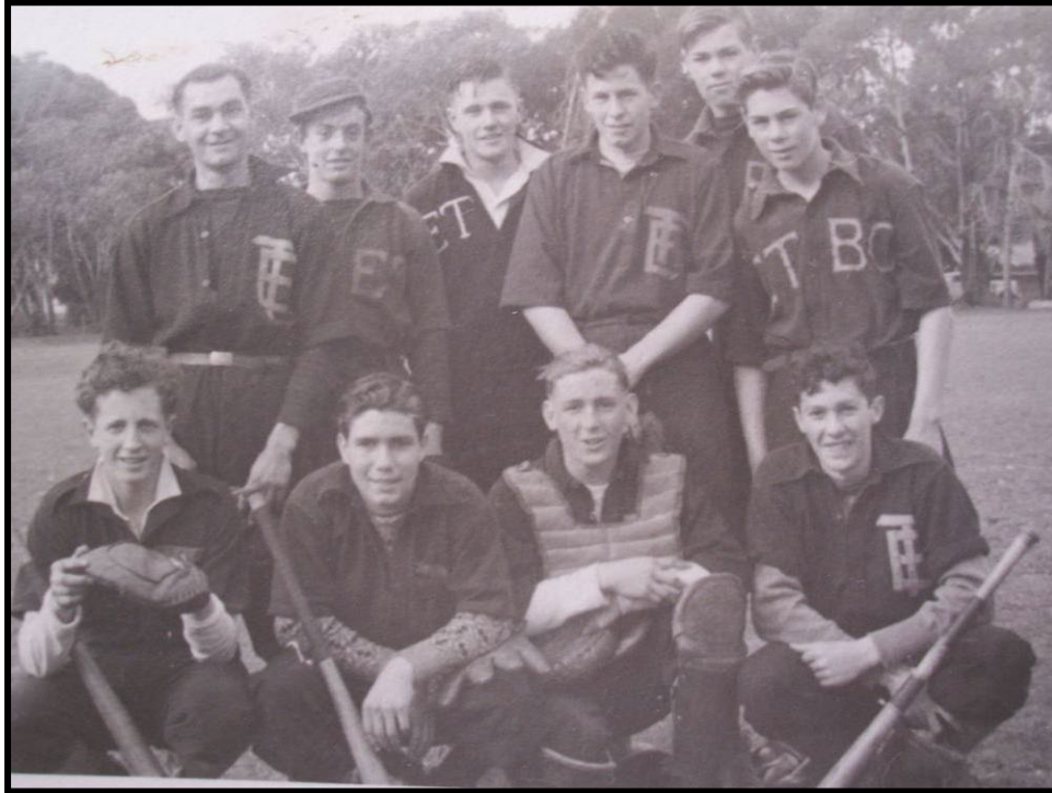
1946 A Grade Team