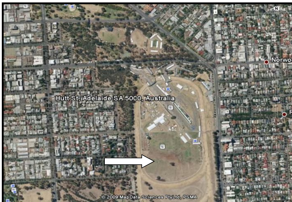
Victoria Park Racecourse

Early information suggests that the southern end of the Victoria Park Racecourse was used for training only, during the 1940's.