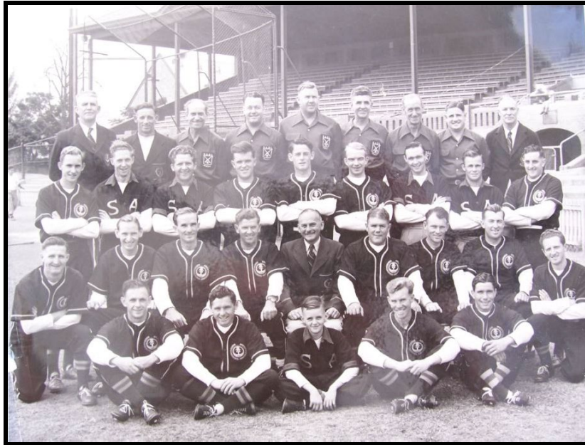
Played Victoria & NSW in Inaugural Season 1952-53